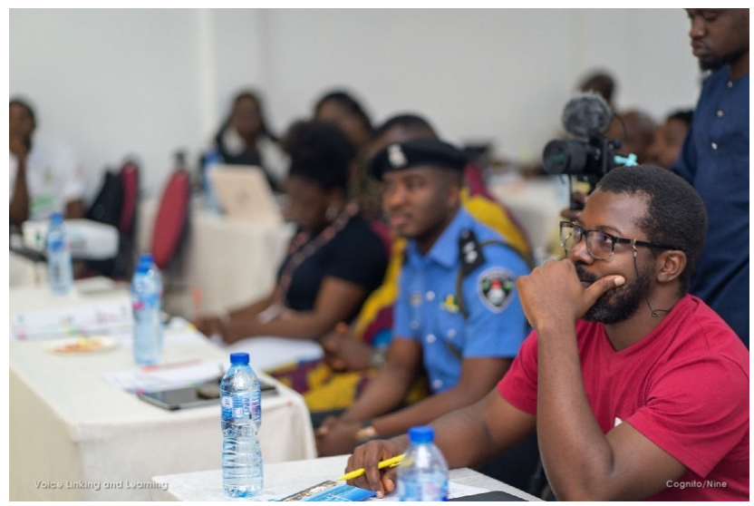
Some stakeholders at the event

responsibility. He drew the attention of the participants to the fact that there is no national program to achieve national equality. Though other organizational advocates commenced the movement for equity (UNICEF, Oxfam, Save the children, Action Aid, UNDP, etc) but this movement might not be sustainable. Other areas in which social justice can be achieved include prioritizing the SDG goals that are in line with Social Justice, consider gender matters and pay attention to how women's lot can be enhanced to make critical decisions in their homes without hostility from spouses.