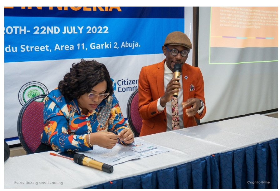
Panel 1 Discussants

with fairness and since needs are different, caution should be taken so that the 'strong' are not been deprived while trying to meet the need of the 'weak'. Lastly, there should be a balance in the society.