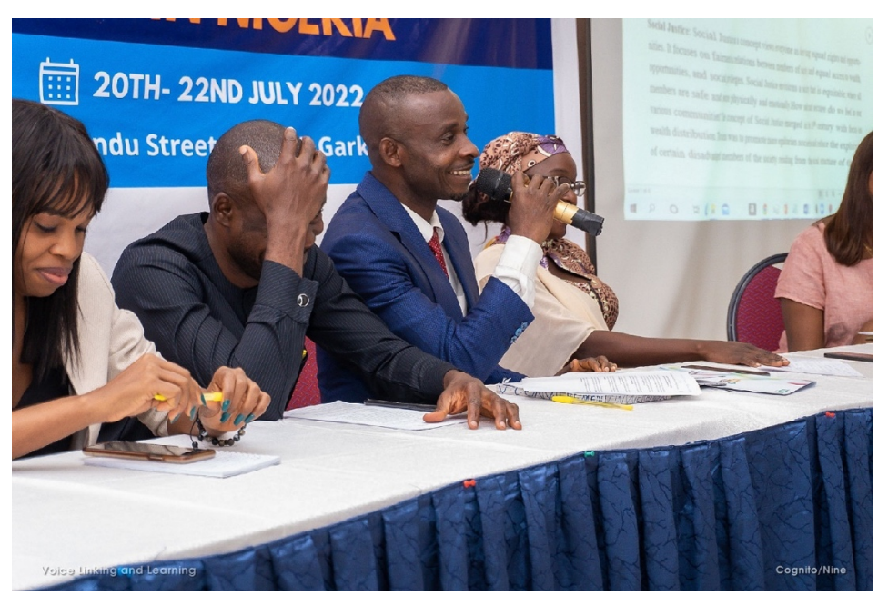
Panel 3 Discussants

Discussions also hovered around how the rights of citizens be protected in the light of Social Justice. Panelists mentioned that knowing your right as a citizen is very difficult, especially in the North where the education levels are significantly lower than the South. This signals that a lot of work has to be done to help citizens understand that they have rights that need to be protected. Additionally, in the process of trying to solve problems for the citizens, they can be made better informed and educated about their rights. Another one was 'What opportunities are available for Nigerians in law?'. They are several avenues including the FOIA (Freedom of Information Act) which is in operation in the country but not in all states.