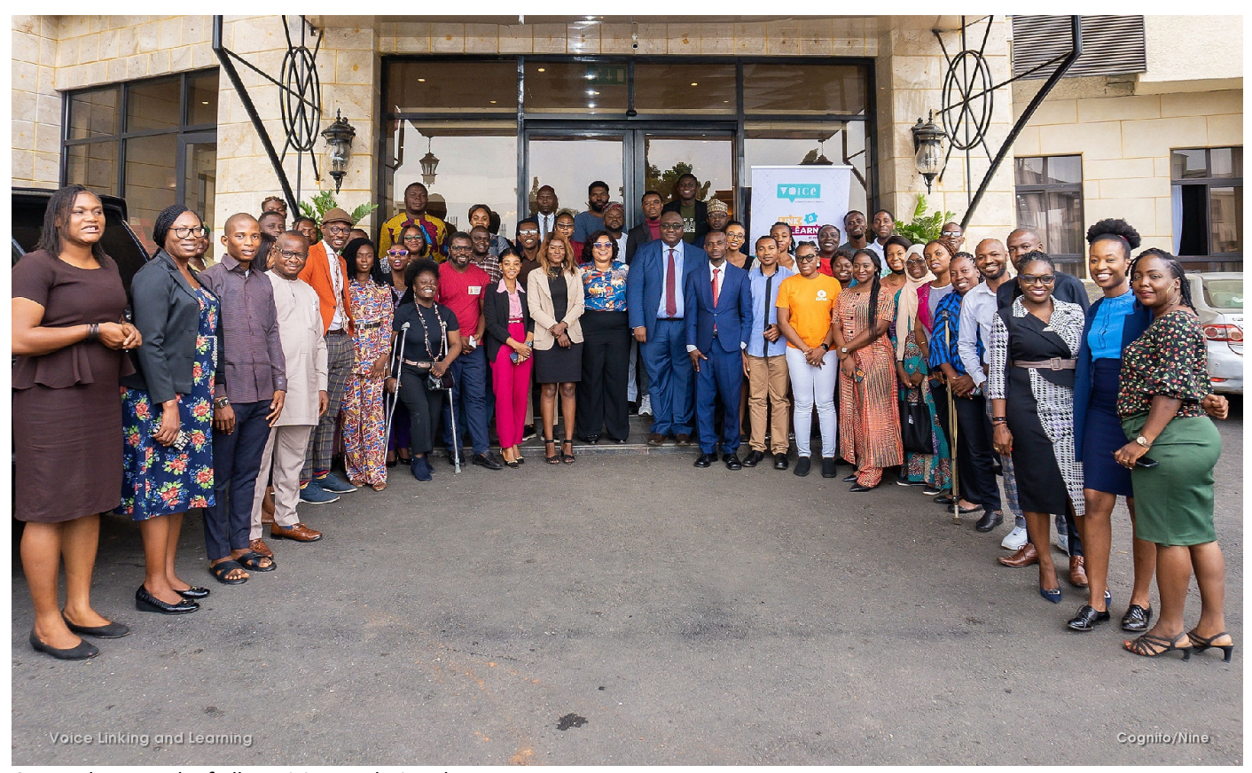
Group photograph of all participants during the event

The one-day stakeholder consultative workshop commenced at 9:00 am on Wednesday the 20th of July with 60 participants as physical attendees while hosting many other participants online. The event which was held at the Bolton White Hotel in Garki area of the Federal Capital territory, attracted stakeholders and participants form far and wide.