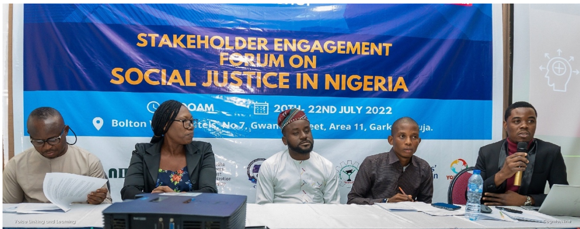
Cross-section of Panel 2 Discussants

First point of discussion was on 'What is the best way to advocate for Social Justice?' In response to this, Mr Terhemba of Raising new voices mentioned that 4 steps help in advocating which includes Research, Plan, Collaborate and Execute. In researching, you know the extent and effect of the problem, Plan using a mapping process (primary planning to meet major stakeholders that have the power to make the desired change and secondary plan, plan on meeting people that share same passion). Planning also involves communicating to stakeholders through the most effective communication of which social media has been identified as a viable tool in advocating for Social Justice. Thirdly, is collaboration with other vision- bearers and fourthly, execution of laid-down plans. The second discussion was an interesting and palpable as it was about EndSARS Protest Judiciary panel report. The panelists were asked to 'Rate the Panel of Enquiry of the EndSARS panel report on the scale of principles of social justice (Access, Equity, Participation and Human Rights).